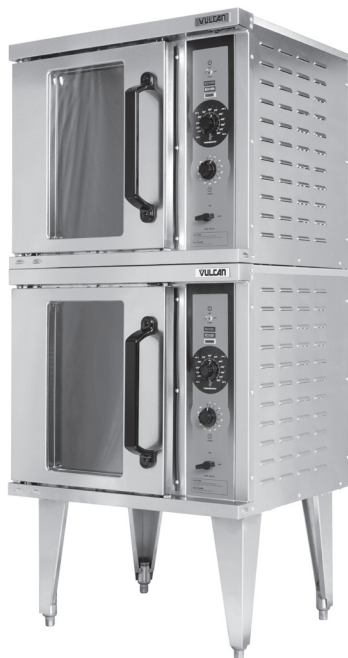
Shown as two (2) GCO stacked ovens