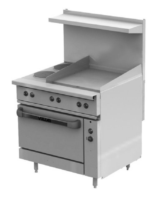
Model EV36S-2FP24G208 shown with adjustable legs