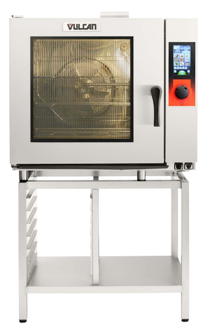
Model TCM61E Shown on optional stand