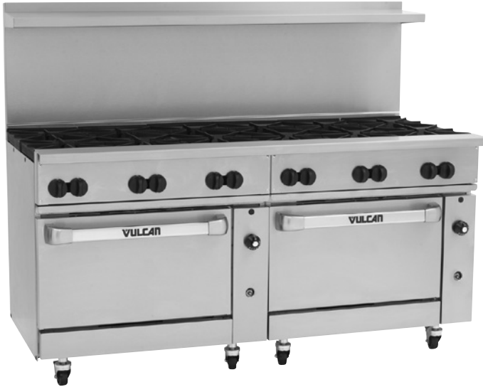
Model 72SS-12BN (shown with optional casters)