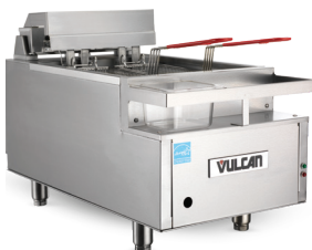
CEF40 shown with optional legs

Industry's first ENERGY STAR® certified 40 lb countertop electric fryer uses less energy resulting in lower energy bills and may qualify for rebates.