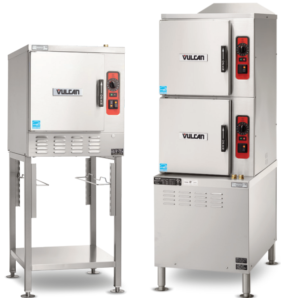
C24EA5 LWE shown on optional stand